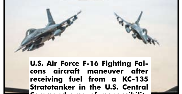
U.S. Air Force F-16 Fighting Falcons aircraft maneuver after receiving fuel from a KC-135 Stratotanker in the U.S. Central Command area of responsibility May 23, 2026.

Go from 0 to 60 with our fast and easy auto loans! 1