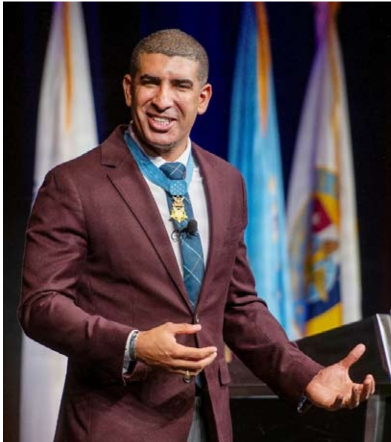
Retired Army Capt. Florent Groberg, a Medal of Honor recipient, delivers the keynote address at the 2026 Military Health System Conference in Dallas, May 27, 2026. He survived and recovered from injuries sustained in Afghanistan in 2012 thanks to the care he received through the Military Health System. He emphasized that strong teams are built by leaders who listen to their people and recognize the value of every team member’s contribution and experience, regardless of rank, age or position.

Born in France and naturalized as a U.S. citizen in 2001, he was commissioned as an Army infantry officer in 2008. On Aug. 8, 2012, while serving as a personal security detachment commander in Asadabad, Af-