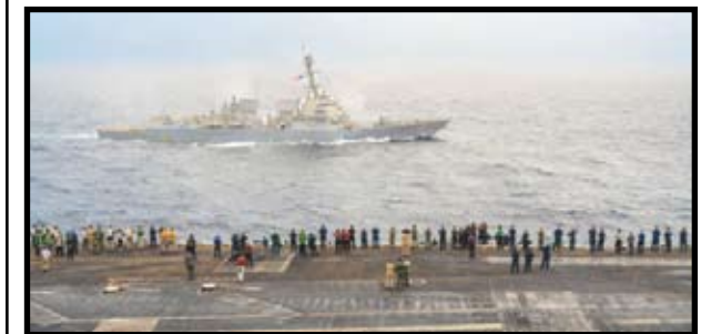
AT SEA (May 25, 2026) Trinidad and Tobago government and military distinguished visitors observe from aircraft carrier USS Nimitz as destroyer USS Gridley fires her five-inch gun during a naval power demonstration. Nimitz is deployed as part of Southern Seas 2026.