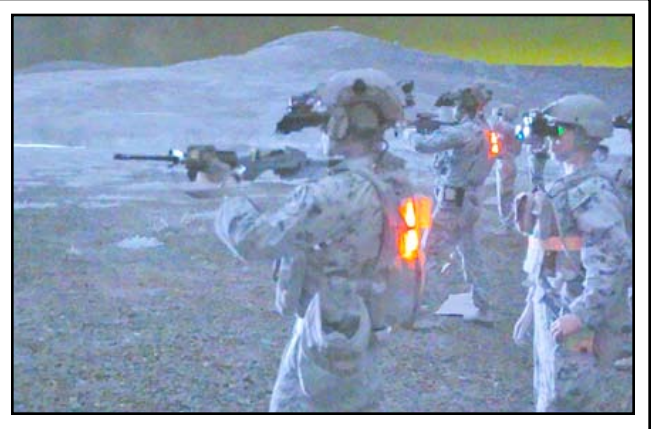
Marines with 1st Air Naval Gunfire Liaison Company fire at night during Basic Skills Package at amp Pendleton Sept. 15, 2023.