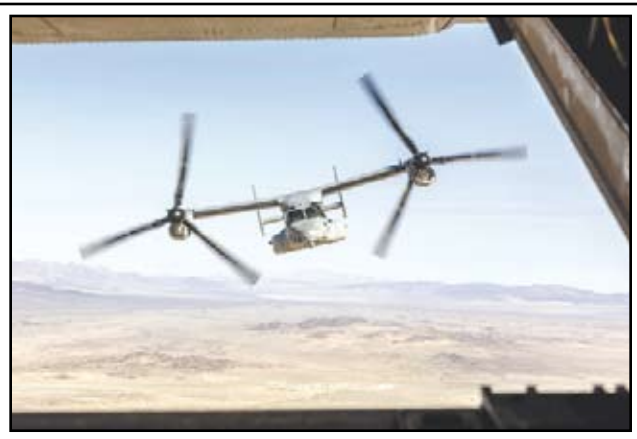
Flying Osprey A Marine Corps MV-22B Osprey flies over Marine Corps Air-Ground Combat Center Twentynine Palms Sept. 7, 2023.