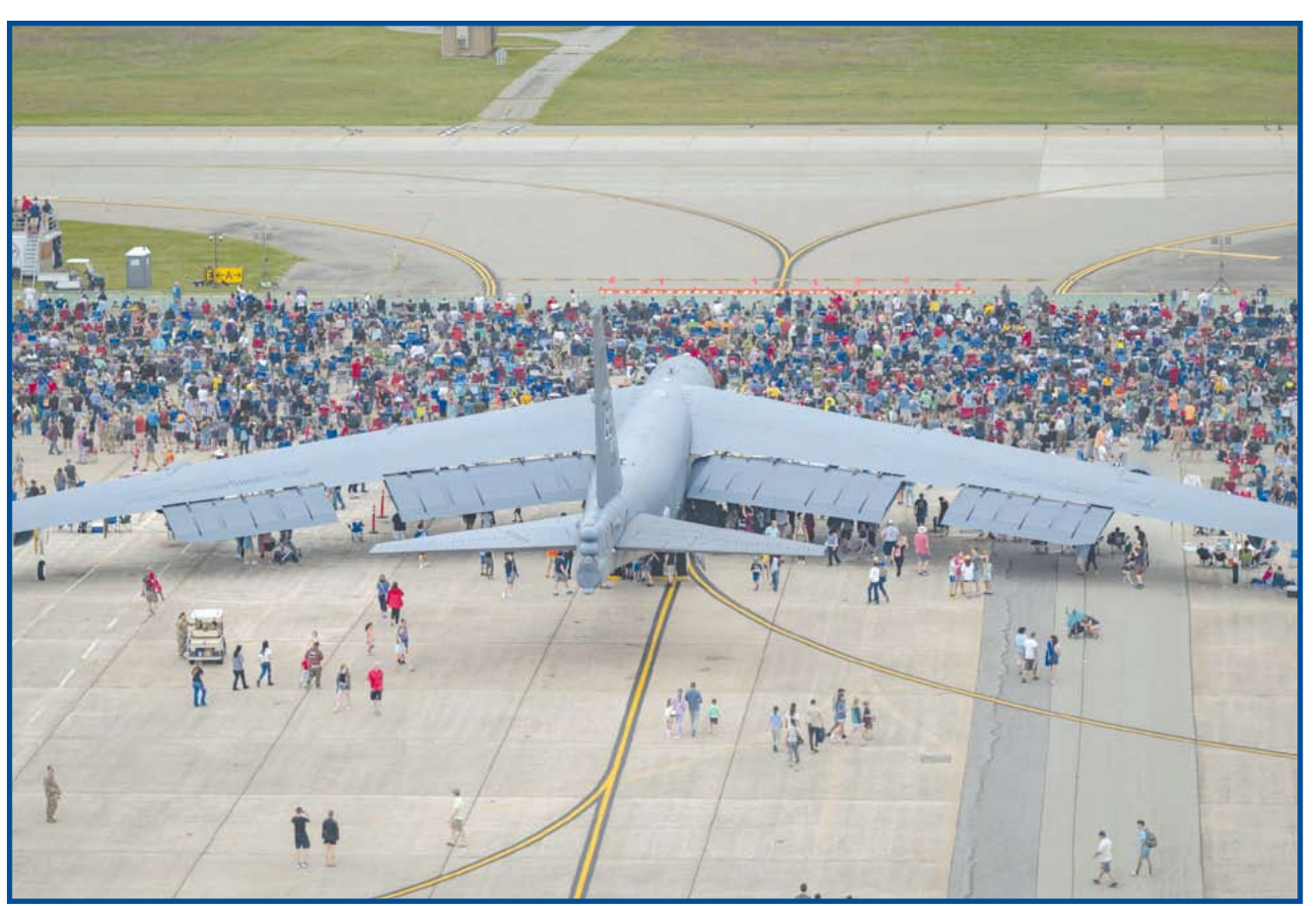
View From Above Spectators gather around an Air Force B-52H Stratofortress during an air show at Pease Air National Guard Base, N.H., Sept. 10, 2023.

SIXTY-THIRD YEAR NO. 18 SEPTEMBER 23, 2023